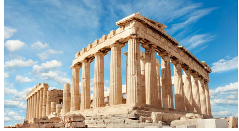
Tour Details Continued on Next Page 🖚

The romantic island of Santorini, located in the very heart of the Aegean Sea, is instantly recognizable for its multicolored cliffs soaring out of a sea-drowned volcanic crater. Today we'll discover the "essentials of Santorini" as we head out to Mount Profitis Ilias Monastery sitting atop the hill with stunning panoramic views of Santorini and the blue waters of the sea. We'll visit the magical coastal town of Oia, known for its labyrinth-like alleys, stunning sunsets, and blue-domed churches. Enjoy a wine tasting at one of Santorini's exclusive wineries before heading to the beautiful Byzantine Church of Panagia. Stroll the beaches of Kamari at the foot of the Mesa Vouno Mountains. We'll end our excursion in Fira, a vision of pristine whitewashed buildings built into dramatic, rugged cliffs that slope into the sea, then make our way down to the harbor via cable car. Meals: B, D